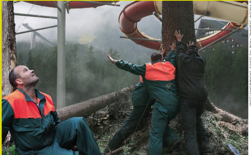
© VINCENT DEBANNE - FROM THE SERIES: DREAMWORKS (2006)