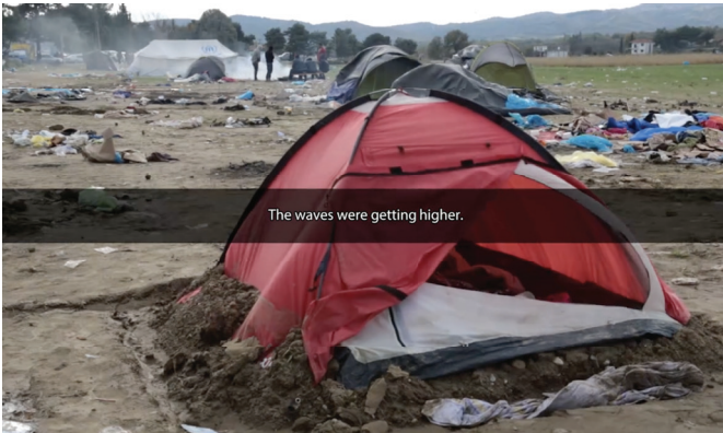
The waves were getting higher.