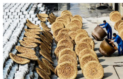
The making of Shaoxing wine