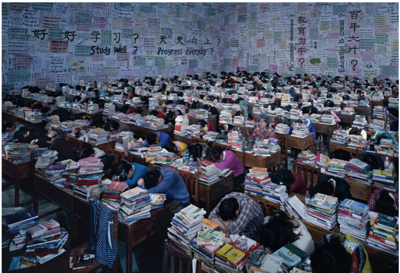
Follow You , Inkjet print, 180cm×300cm, 2013, by Wang Qingsong.