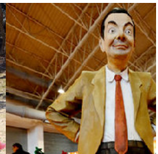
Int'l Creative Design Exhibition Beijing