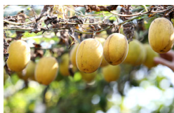
The Arhat fruit in the mountains