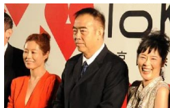
Opening ceremony of 26th Tokyo International Film