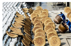
The making of Shaoxing wine