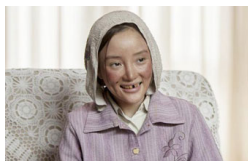
Li Xiaolu's multiple roles in 'Personal Tailor'