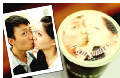
Cafe prints lovers' photos on latte froth